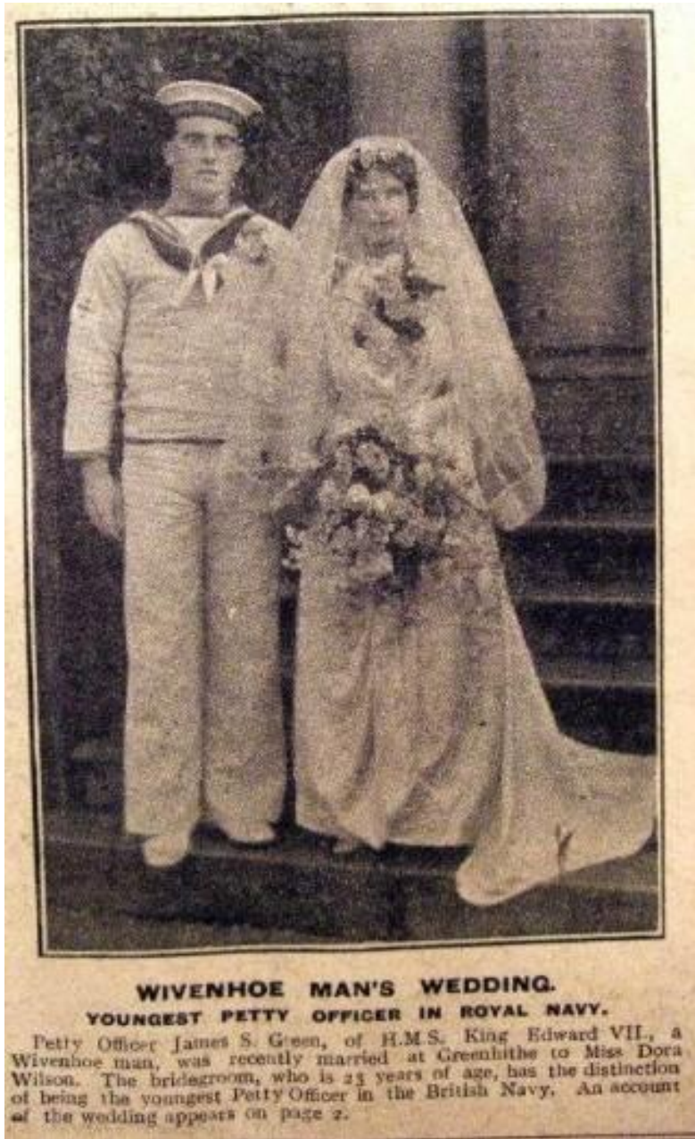
WIVENHOE MAN'S WEDDING.