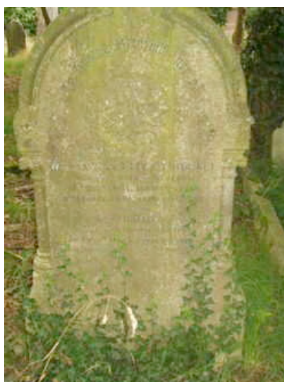
The headstone in St Mary's Wivenhoe