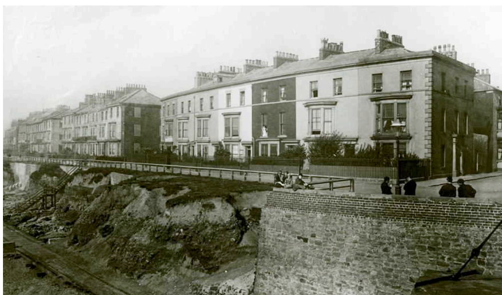
No 3 South Crescent is the third house from the left of the main row in the photograph.